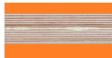
GOOD RESULTS ACHIVED: PLYWOOD TO PLYWOOD PLYWOOD TO LMINATES