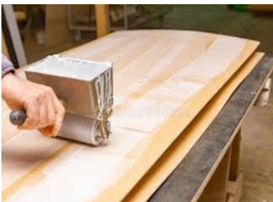
EASY OF APPLICATION: VERY SMOOTH

(Available in Open mouth 30Kg pack only, Spl. packing on request and MOQ basis.)