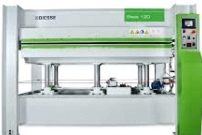
IMPRESSIVE RESULTS IN HOT AND COLD PRESSING